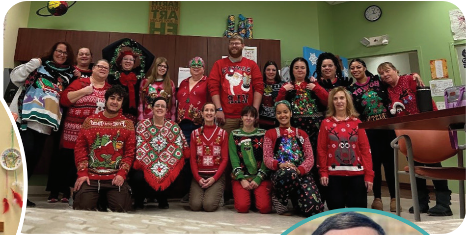
Ugly Sweater Day!