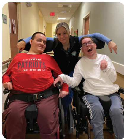
The nursing department at ECE is warm and welcoming, always willing to lend a hand, and keeps our member needs as its top priority. With friends like this, a trip to see the nurse is always fun and exciting.