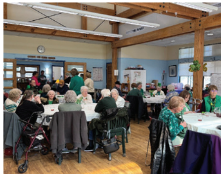
Members celebrating St. Patrick's Day at South Shore Conservatory