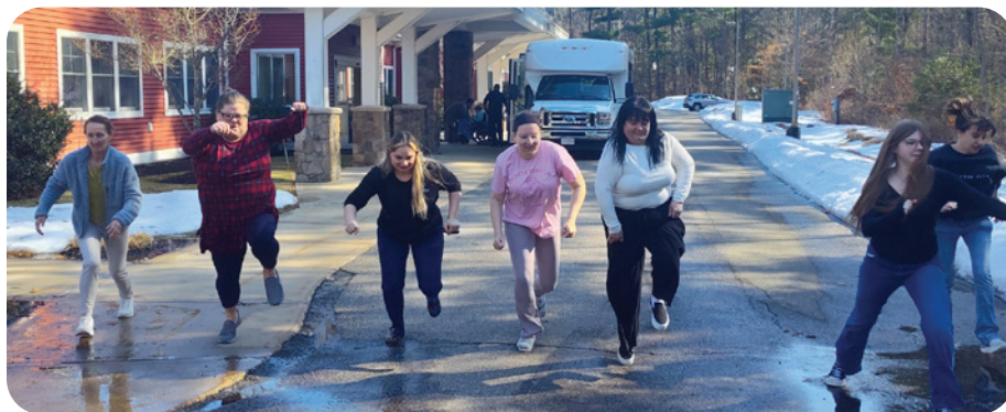
After the blizzard of 2026, staff at the Efron Center enjoyed an early taste of spring weather and some fun outside of the Efron Center with melting snow all around. The winner of this skipping contest is still up for debate.