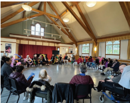
Hanson Council on Aging hosts The Living Center (TLC) with Irish songs, dance, and trivia games.