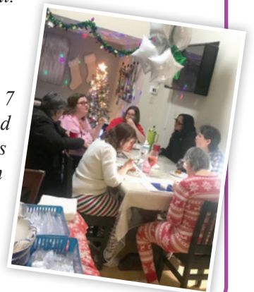
The Apartment 7 ladies celebrated the holidays together with festive pajamas and a great meal.