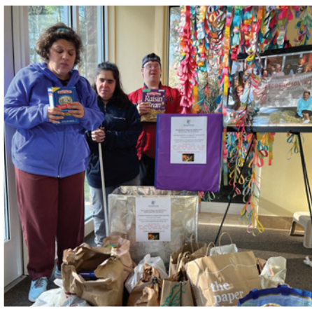
ECE members help out at the Pembroke Firehouse Food Pantry.