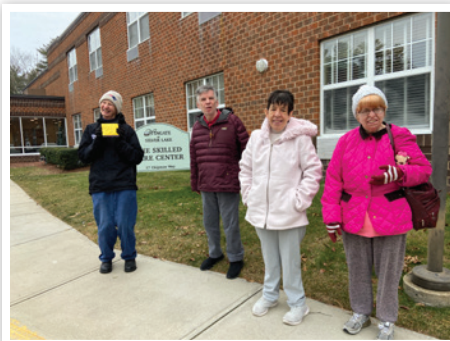
NEV residents bring cards to residents of Wingate at Silver Lake.