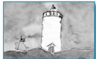
"Lighthouse" by Janice Hiatt.

A collaboration of New England Village Resident and Craft Creations Artisans was on display at the Pembroke Public Library during the month of July. This exhibit featured watercolor and acrylic paintings, drawings, mixed media collages, and photography. ■