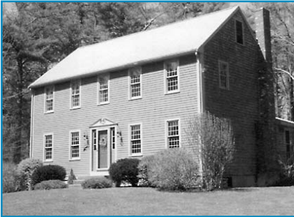
624 School Street