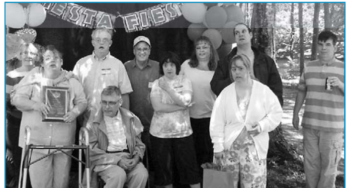
Family Day “Team of the Year.”

TLC program members were recognized at this year’s Family Day celebration as recipients of the “Team of the Year” award. This award recognizes day service participants who have demonstrated exemplary team work and leadership in achieving a shared goal. Congratulations to a well deserving group! ■