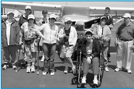
The group poses in front of one of the airplanes.

bridge from toothpicks and marshmallows. The group also “visited” Kitty Hawk, North Carolina where Orville and Wilbur Wright flew the first powered airplane, so a visit to the Plymouth Airport seemed rather fitting. Everyone was treated to a tour of the maintenance shop and when brought out onto the runways, members were able to sit in a small engine plane donning hats donated by Alpha One Flight Services. Everyone also enjoyed watching the planes and helicopters take off and land. Events such as a rodeo and volcano