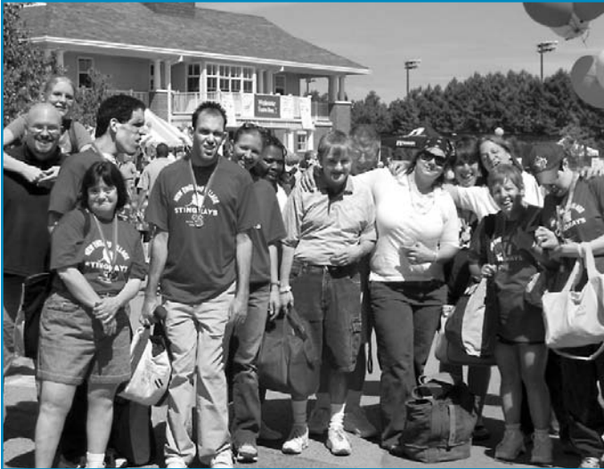
The NEV Stingrays.